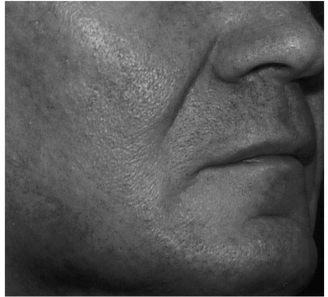
Figure 4. Complete lesional eradication was achieved after a total of four PDL treatments (fluences 7.0–7.5 J/cm 2 ) without evidence of recurrence 18 months postoperatively.

sirable, as well as psychosocially distressing as a result of their predominately facial location.