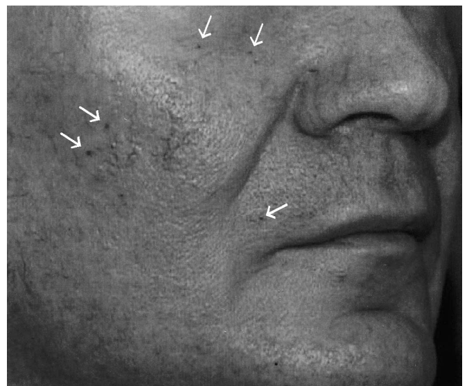
Figure 1. Multiple bluish-hued papules are present on the cheeks and infraorbital regions. The patient reported lesional enlargement with exercise or upon exposure to sun or humidity.

Treatment was initiated with a 585 nm flashlamp-pumped long-pulsed (1.5 msec) dye laser using a 7.0 mm spot size at a fluence of 7.0 J/cm 2 , producing an immediate purpuric tissue response. Postoperative wound care consisted of daily cleansing with mild soap and water followed